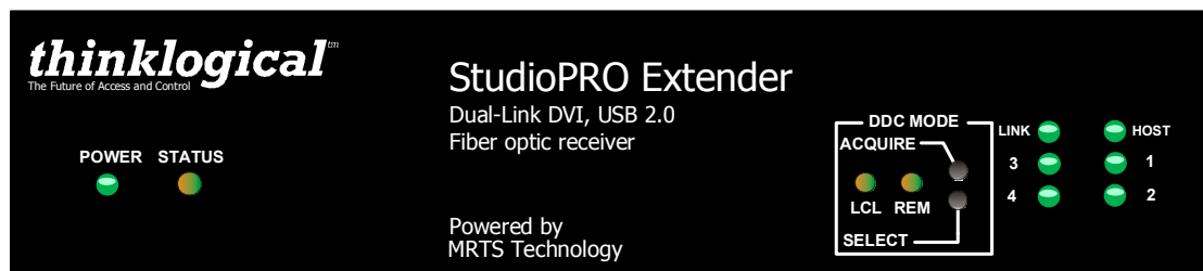
StudioPRO DUAL-LINK EXTENDER RECEIVER

STEP 1: Install any USB peripheral devices to the receiver's USB 2.0 ports.