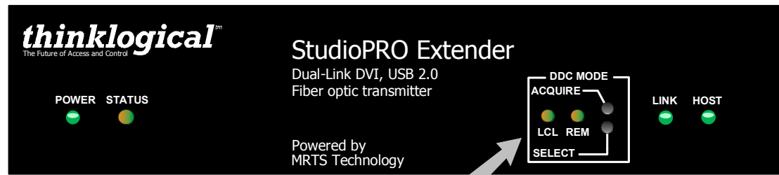
StudioPRO DUAL-LINK EXTENDER TRANSMITTER

STEP 5: Connect the supplied +5V power supply (PWR-000022-R) to the transmitter and plug it into a standard AC source.